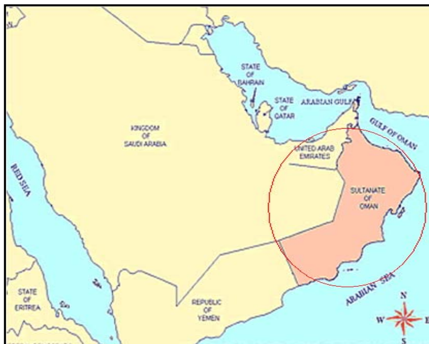
Figure 1: location of the Sultanate of Oman